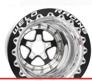
ALUMASTAR 2.0 SERIES (SFI 15.1)

AVAILABLE IN 15" AND 16" DIAMETERS UP TO 16" WIDE IN NON-BEADLOCK, SINGLE OR DOUBLE BEADLOCK CONFIGURATIONS.