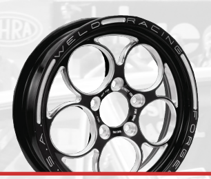
MAGNUM 2.0 1-PC FRONTS SPINDLE MOUNT AVAILABLE