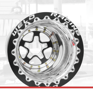
15" ALUMASTAR BEADLOCK