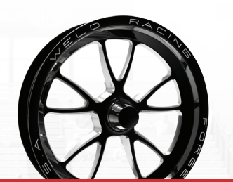
FULL THROTTLE SPINDLE MOUNT

AVAILABLE IN 15"AND 16" DIAMETERS UP TO 16" WIDE IN NON-BEADLOCK, SINGLE OR DOUBLE BEADLOCK CONFIGURATIONS.