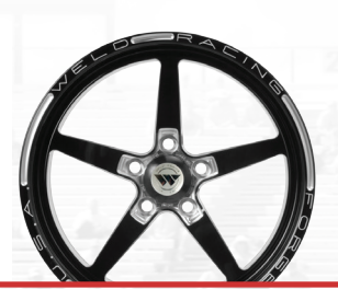
ALUMASTAR 2.0 1-PC FRONTS SPINDLE MOUNT AVAILABLE