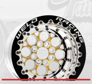
MAGNUM IMPORT DRAG SERIES

AVAILABLE IN 13"AND 15" DIAMETERS UP TO 16" WIDE IN NON-BEADLOCK. SINGLE OR DOUBLE BEADLOCK CONFIGURATIONS.