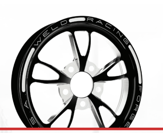
FULL THROTTLE LUG MOUNT