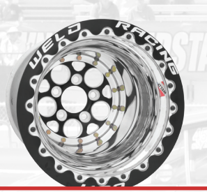
15" MAGNUM BEADLOCK